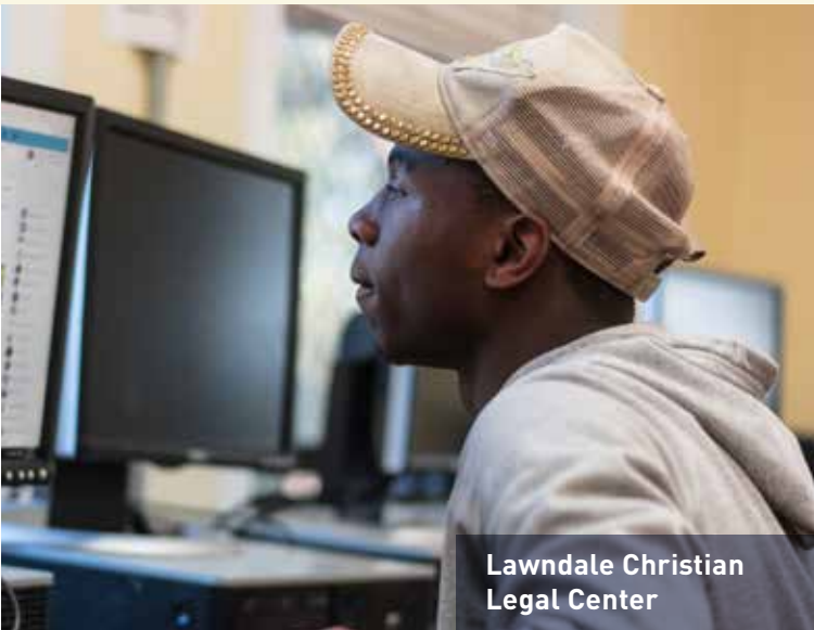
Lawndale Christian Legal Center

Our Impact: We seek to support programs serving low-income women and men who desire the education, skills, and training required to acquire living-wage employment that enable them to support themselves and their families. We also seek to build economic opportunity within geographic communities affected by poverty, violence, and inequality.