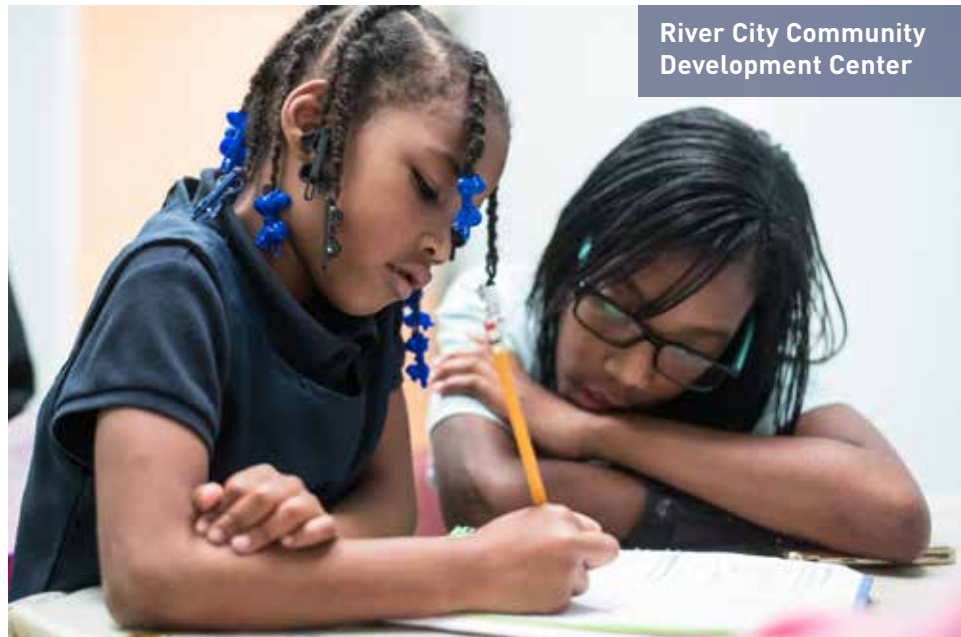
River City Community Development Center

We believe that poverty, violence, and inequality are the greatest factors impacting communities, which is why we adapted our own mission. We have shifted our focus to the intersection of poverty, violence, and inequality—with a preference for solutions within the areas of education, workforce development, and