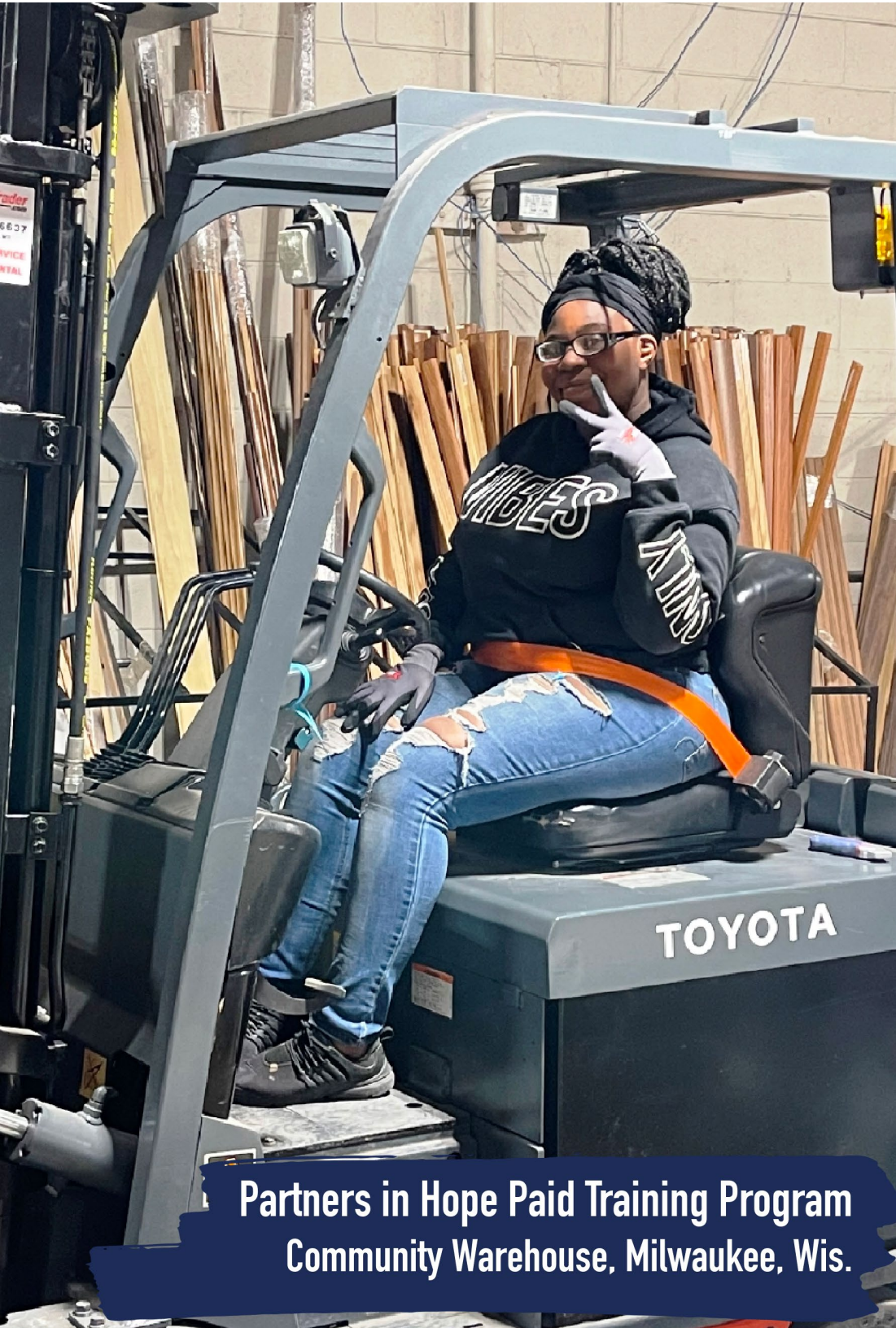
Partners in Hope Paid Training Program Community Warehouse, Milwaukee, Wis.